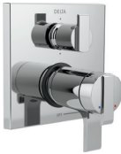
TempAssure® 17T Series Valve Trim with 6-Setting Integrated Diverter T27T967, R22000